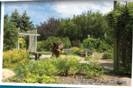
Heritage Rose Garden