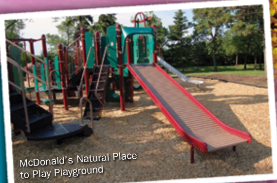
McDonald's Natural Place to Play Playground