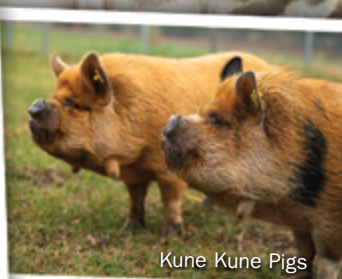
Kune Kune Pigs