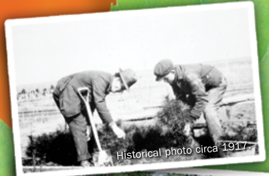
Historical photo circa 1917

Discover a vibrant collection of creatures, spaces to celebrate, magnificent gardens to stroll and a site steeped in history. Find yourself at the Saskatoon Forestry Farm Park & Zoo.