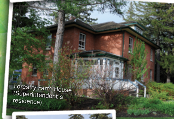
Forestry Farm House (Superintendent's residence)