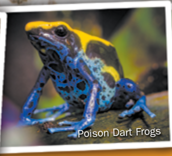
Poison Dart Frogs