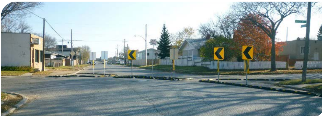
Figure 5.15 Avenue C and 38th Street – Temporary Device (Mayfair Neighbourhood)

The purpose of a diverter is to obstruct shortcutting or through traffic.