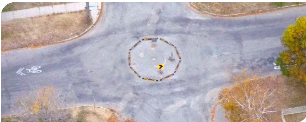
Figure 5.5 Temporary traffic circle on 23rd Street (part of the Bike Boulevard)

A traffic circle would be recommended for local streets only.