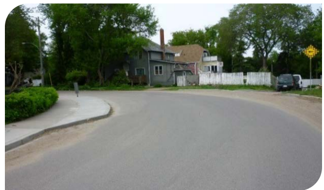
Saskatchewan Crescent (Nutana Neighbourhood)