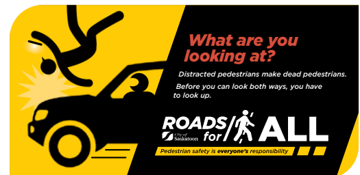
Figure 5.2 - “Roads for All” pedestrian safety campaign

Targeted education campaigns are initiatives to raise awareness of road safety issues. Education campaigns can be effective at changing attitudes and perceptions; however, the benefits may not result in lasting change.