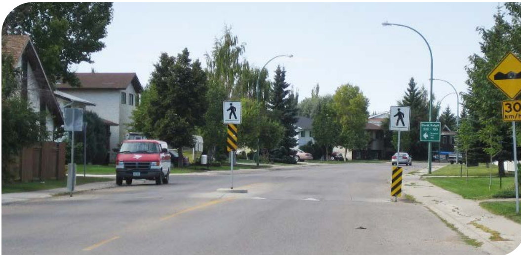
Figure 5.11 Meilicke Road between David Knight Crescent and Stechishin Crescent (Silverwood Heights Neighbourhood)

A raised crosswalk is a marked pedestrian crosswalk at an intersection or mid-block location constructed at a higher elevation than the adjacent roadway. Raised crosswalks may help reduce vehicle speeds and improve pedestrian visibility, thereby reducing pedestrian-vehicle conflicts.