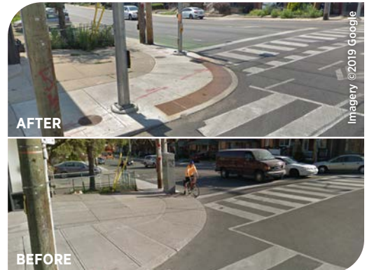
Figure 5.7 - Corner Radius Reduction on Davenport Rd. and Christie St. in Toronto, ON

The purpose of a reduced curb radius is to slow right-turning vehicles, reduce crossing distance for pedestrians, and improve pedestrian visibility.