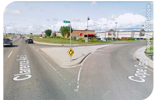
Figure 5.16 - Clarence Avenue and Cope Crescent (Stonebridge Neighbourhood)

A right-in/right-out island is a raised triangular island at an intersection approach. A right in/right-out island restricts left turns, and through movements to and from the intersecting street or driveway. The purpose of right-in-right-out island is to obstruct shortcutting or through traffic.