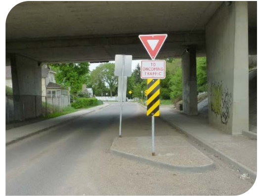
Figure 5.6 - Pinch Point on Saskatchewan Crescent (Nutana Neighbourhood) indicating that traffic must yield to oncoming traffic.

A choker is a curb extension at midblock or intersection corners that narrows a street by extending the sidewalk or widening the planting strip. It can leave the cross section with two narrow lanes or a single lane. Chokers are often referred to as pinch points, or midblock narrowing.