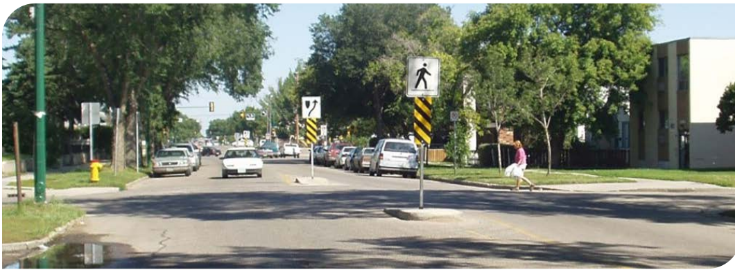
Figure 5.4 Avenue P and 21st Street (Pleasant Hill Neighbourhood)

Typically, raised median islands are designed using concrete and often have a mountable median tip. They are often 1.5 m in width.