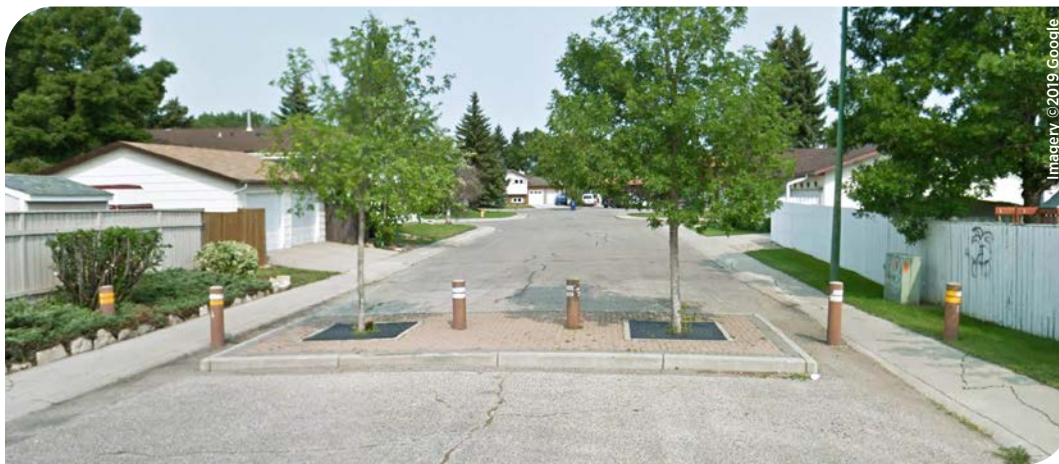
Figure 5.18 Coppermine Crescent and Churchill Drive (River Heights Neighbourhood)

Full closure is a barrier extending across the entire widths of a roadway that restricts all motor vehicle traffic movement from continuing along the roadway. The purpose of a full closure is to eliminate shortcutting or through traffic. It can be designed to allow pedestrian and cyclist access.