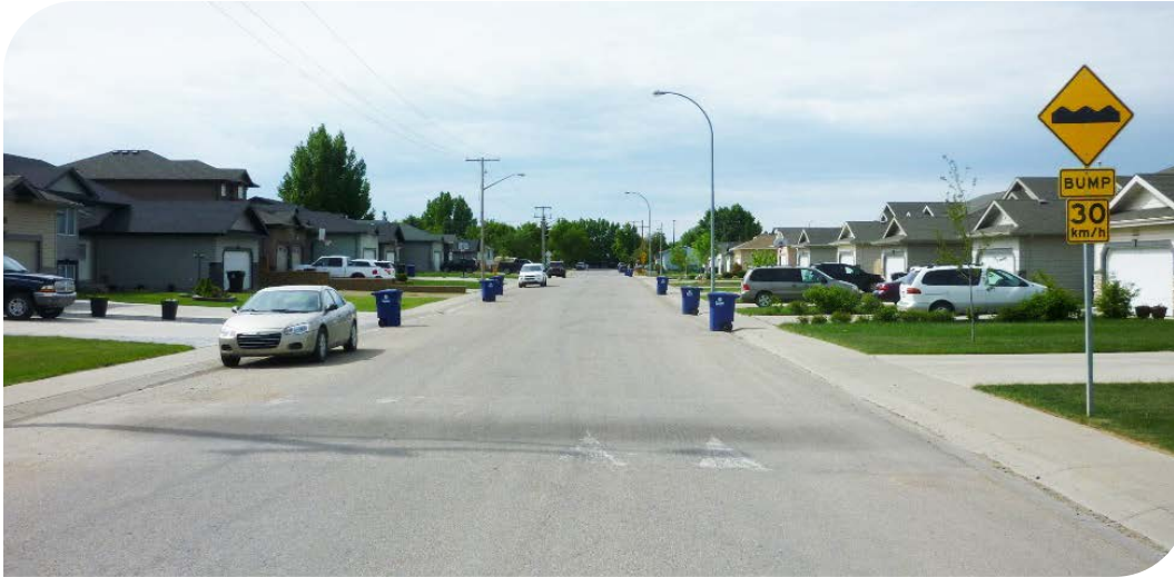
Figure 5.14 Speed Hump on Hughes Drive (Dundonald Neighbourhood)

A speed hump is a raised area of roadway that deflects both the wheels and frame of a traversing vehicle. Speed humps should only be considered if other traffic calming measures are not applicable or if there is excessive speed on a street.