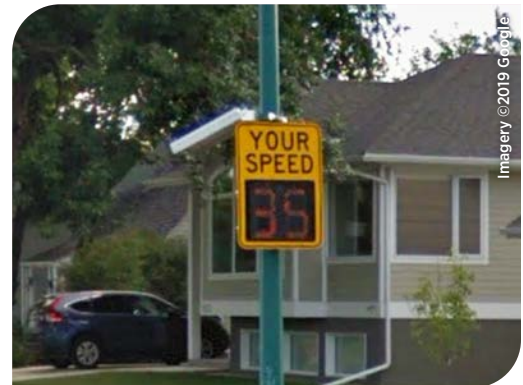
Figure 5.1 - Spadina Crescent East (North Park Neighbourhood)

Speed display boards are used as traffic calming devices in addition to or instead of physical devices.