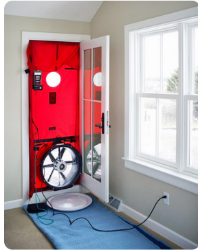
Figure 2: Blower door test

Before sealing any leaks in your home, it is important to have a registered Energy Advisor perform an EnerGuide audit, which includes a Blower Door Test, and determines how much air flows through your home. Airtightness is measured by placing a depressurizing fan inside one of the doors and