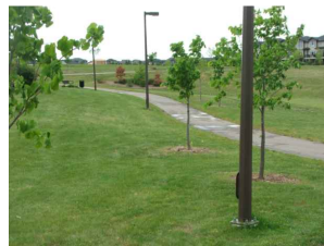
Al Anderson Park