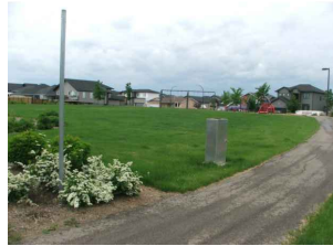
Rik Steernberg Park