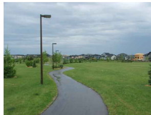
Hampton Village Square