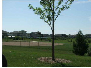
Draggins Car Club Park