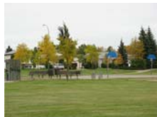
Senator J. Hnatyshyn