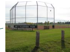
Senator James Gladstone