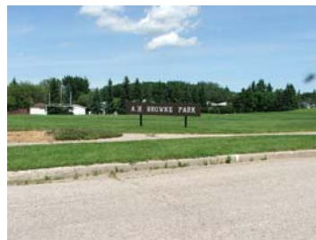
A. H. Browne Park