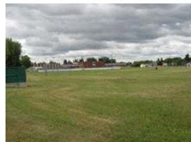
A.S. Wright Park