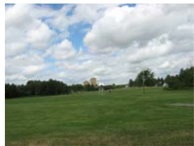
James Anderson Park