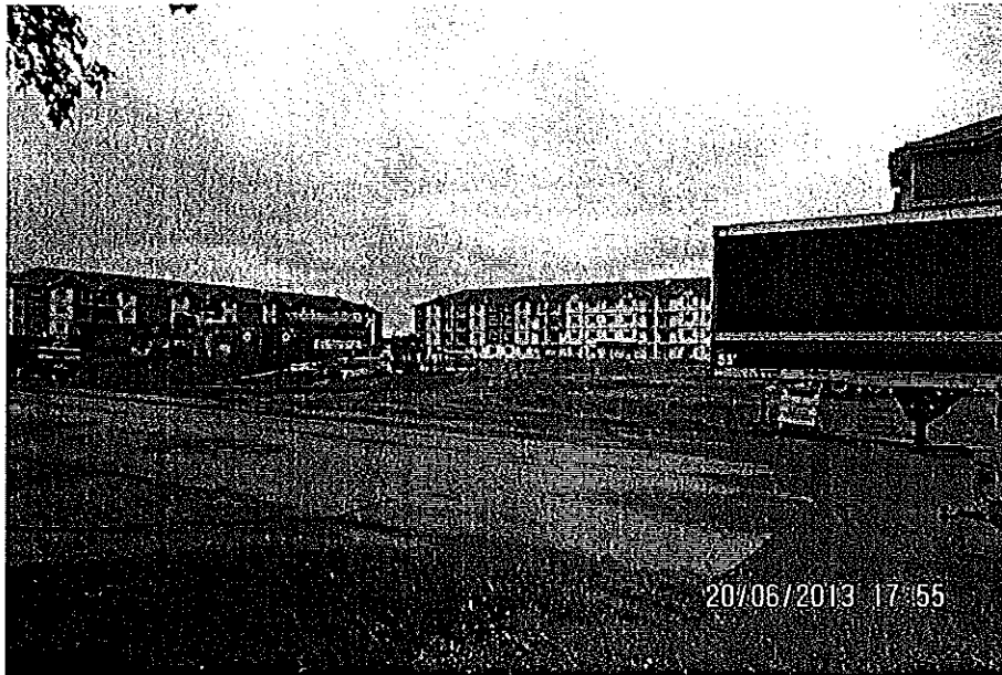
192 apartments across from single dwelling houses.