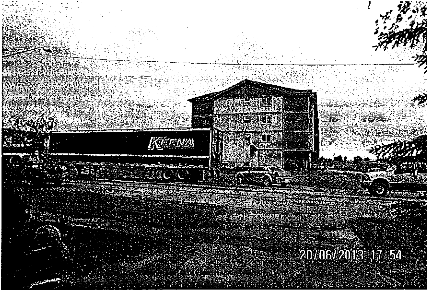
Directly across from my driveway.