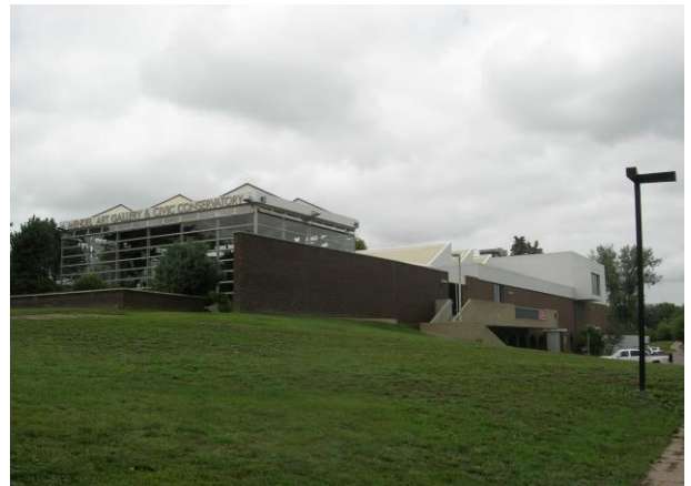
South and East Façades (2015)