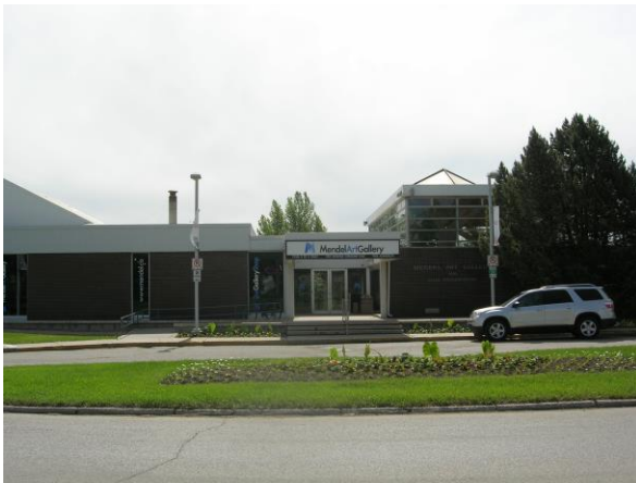
West Façade (2011)