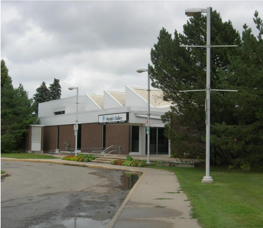
West Façade (2015)