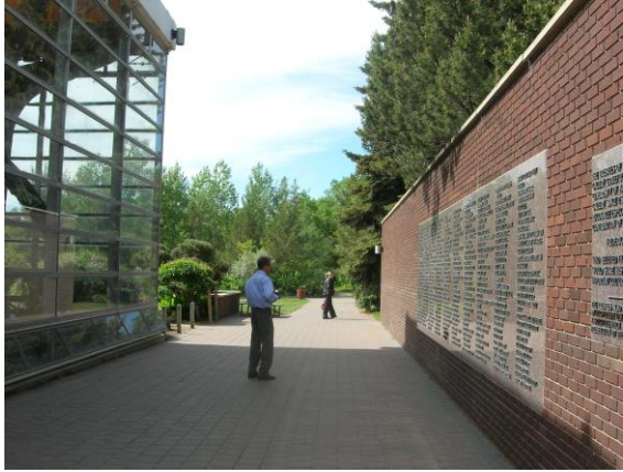
Donor Wall (2011)